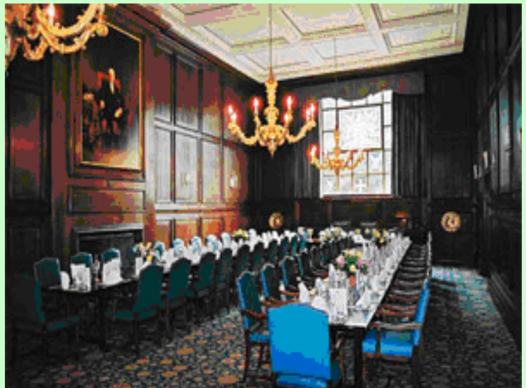
Dining Room – Innkeepers Hall